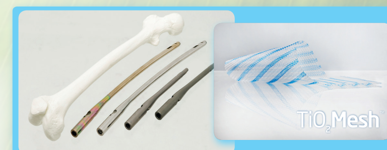
Implant samples coated with anti-bacterial and/or anti-allergic TiOCer™ - compared to a human femur (The presented materials are demonstrators only).

TiOCer™ is a ceramic like titanium oxide coating, which reduces the leaching of metal ions – like cobalt or chrome – out of the implant surfaces. Currently, the TiOCer™ coating is in use to improve the biocompatibility of the TiO 2 Mesh™ surgical mesh implants produced and distributed by BioCer Entwicklungs-GmbH, Germany.