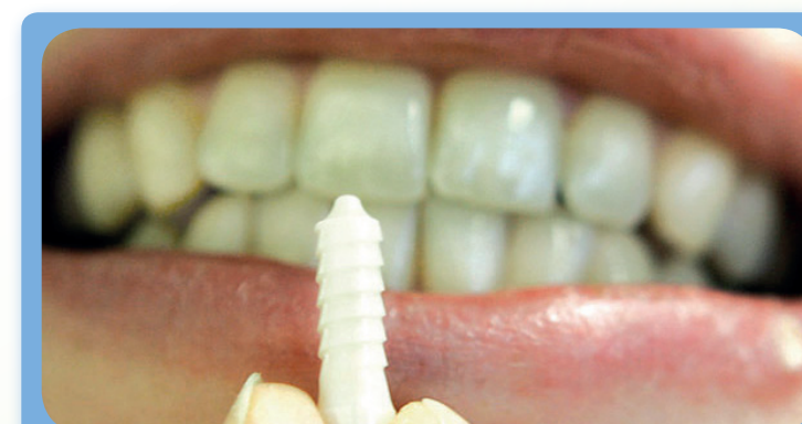
A zirconium dental implant with an osteoconductive (bone growth promoting) coating - OsteoCer™ from BioCer Entwicklungs-GmbH (The presented materials are demonstrators only)